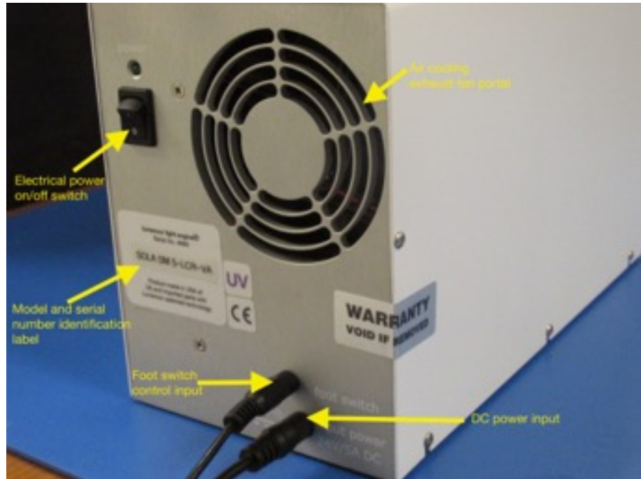
Figure 1. SOLA SM 365 light engine rear panel

Position the unit in an orientation that allows unrestricted access to the DC power connector at the back of the light engine. In an emergency, you may need to disconnect power to the unit quickly. The rocker switch in the top left corner of the rear panel controls electrical power to the unit. A green LED above the switch indicates that power to the light engine is ON. Refer to Figure 1 for the rear panel locations of the input DC power connection, the foot pedal connection and the master electrical power switch. Note that the foot pedal is an on/off toggle