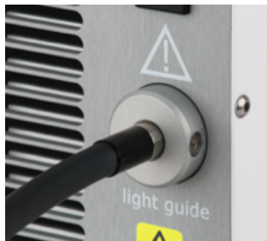
Figure 2. Light guide port

The SOLA SM light engine has a safety interlock for the light guide that prevents light output unless a liquid light guide is fully inserted into the light guide port. Before operating the unit, make sure the 3 mm diameter liquid light guide is properly installed in the light guide port (Figure 2). The set screw should be loosened using a 2 mm hex wrench so the light guide slides all the way into the receptacle without obstruction. Once the light guide is fully inserted, lightly tighten the set screw to hold it in place and prevent inadvertent disconnection. Prior to turning the light on, be sure the output end of the light guide is safely directed into an enclosed optical path (e.g. microscope input collimator or a beam dump). Do not bend the light guide beyond its specified minimum bending radius (40 mm or 1.6 inches). Extreme bending of the light guide may cause permanent deformation, resulting in decreased light transmission. Take necessary precautions to protect yourself and others from the high intensity light when turning on the unit.